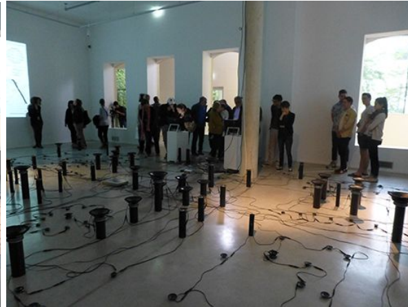
Photos of install at la Panacee France