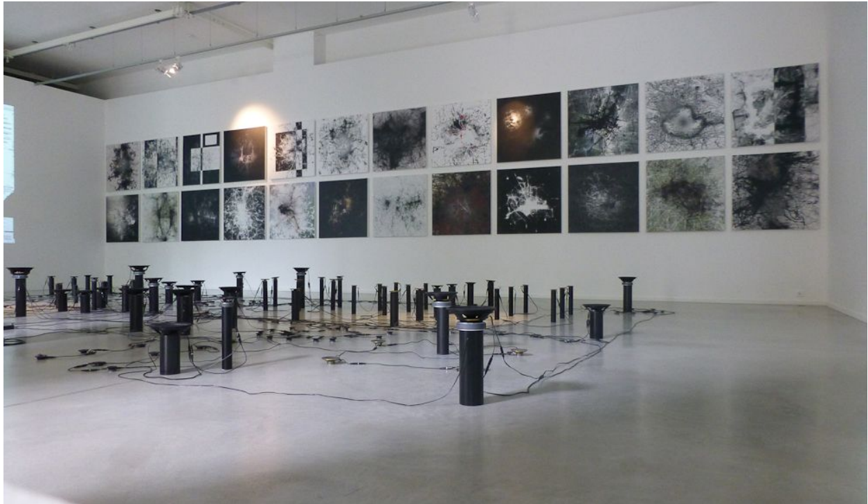
ALSO shown with Stanza paintings of data and noise maps optional.